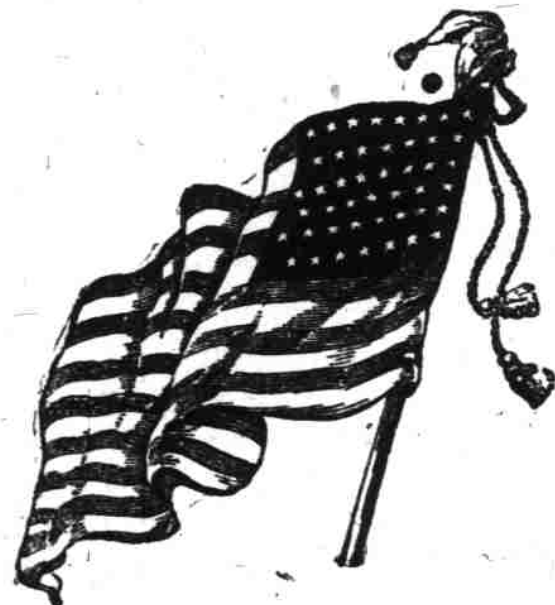
"Long May It Wave."

THE AMERICAN PRESS ASSOCIATION, 225 West 39th Street, New York City, is our sole and exclusive Foreign Advertising Agent.