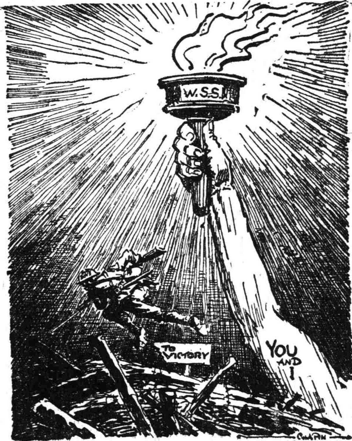
W. S. S. TAKE THE BOYS "OVER THE TOP"

President Wilson Proclaims June 28 National War Savings Day.—Governor Bickett Designates June 23-28 War Sav- ings Week.—Every Person Will Be Asked to Pledge.