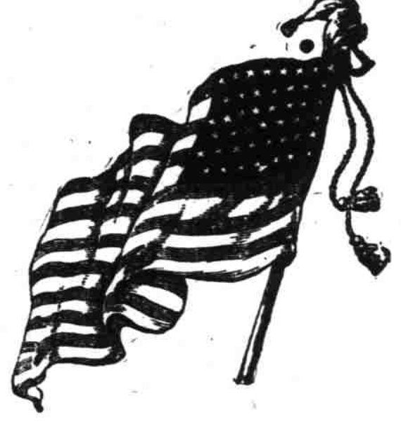
"Long May It Wave."

THE AMERICAN PRESS ASSOCIATION, 225 West 39th Street, New York City, is our sole and exclusive Foreign Advertising Agent.