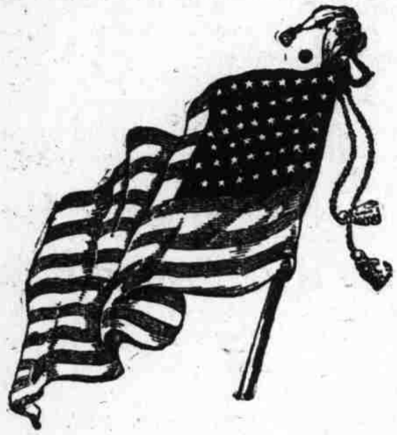
"Long May It Wave."

THE AMERICAN PRESS ASSOCIATION, 225 West 39th Street, New York City, is our sole and exclusive Foreign Advertising Agent.