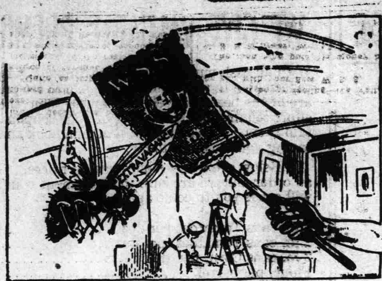
Swat the Fly.