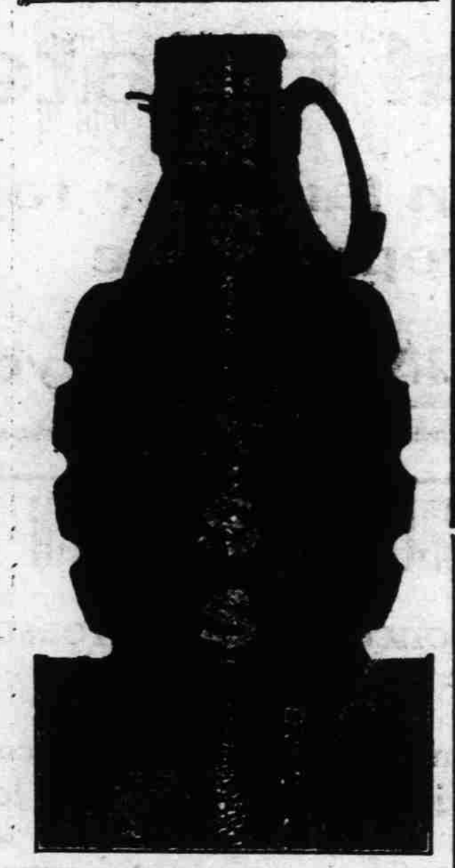
MAND GRENADE SAVINGS BANK ranged that a grenade bank will be awarded to each child, who, during the vacation period, earns enough money to buy a War Savings Stamp.

Distribution of the grenades in the several Federal Reserve Districts will be left in the hands of the district Savings Directors. In this district the War Loan Organization, with head-quarters in Richmond, Va., has so ar-