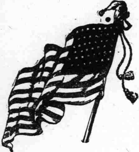
"Long May It Wave."

THE AMERICAN PRESS ASSOCIATION, 225 West 39th Street, New York City, is our sole and exclusive Foreign Advertising Agent.