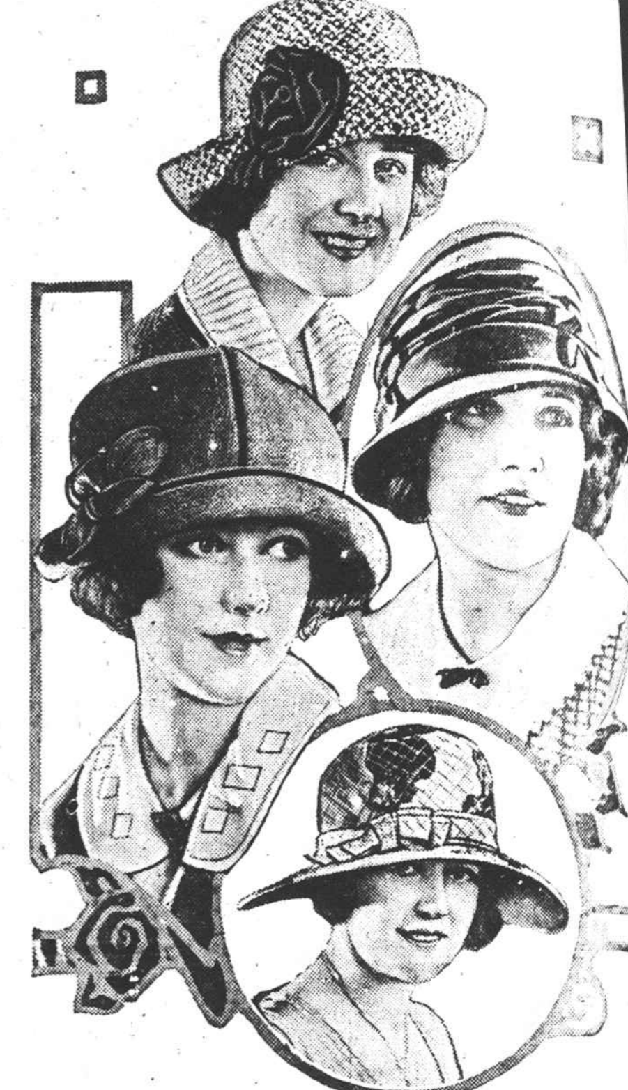
DIVERSITY SHOWN IN SPORTS HATS

tain dashing models have long quills or brilliant flat birds simulated in small, soft, varicolored feathers. Handmade decorations and fine combinations of light color distinguish the most elaborate sports hats, while the simplest are trimmed with a scarf or kerchief or with a single ornament. The group of hats pictured is representative of the mode. It begins with a model in which chenille is woven into a favored shape and trimmed with a show of ribbon. Below, at the right, a sand-colored felt shows the crown