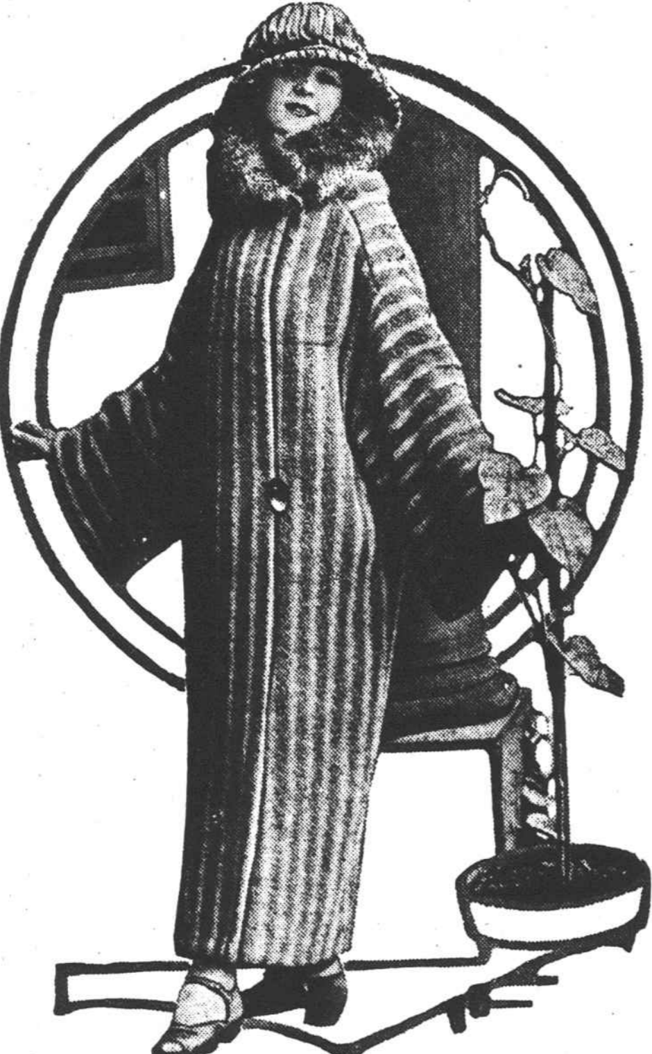
CAMEL'S HAIR USED IN THIS DESIGN

reached that stage in life where she is neither a little girl nor yet a young lady always presents some difficulty. There is no little tragedy, for the young person herself in being forced to wear clothes that she feels she has outgrown and on the other hand it is certainly unwise to permit her to dress as a grownup. Consequently, the styles advanced for her special benefit are in the nature of a compromise and for the current season the compromise is a peculiarly happy one. "This is true because "grown-up"