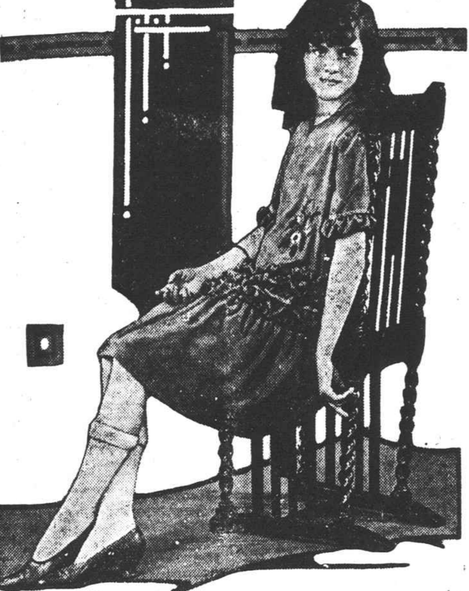
SLIPOVER PATTERN IN CREPE DE CHINE

frocks, coats and suits follow very simple lines and junior garments patterned after them naturally avoid the sophisticated appearance of elaborate flounces, drapes, frills and furbelows. The little frock pictured, for instance, is of navy crepe de chine made in a simple slipover pattern which hangs in perfectly straight lines to the knee. The low waistline is defined with rows of shirred tucking, which is also used on the short sleeves. The only other ornamentation is a touch of embroidery done in bright shades of yellow and green. Junior coats for fall and winter wear are practically miniature editions of those worn by mothers and elder sisters. The same warm colors in delightfully soft sport wools, the