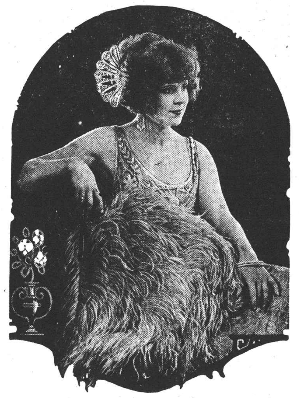
Displaying Latest Accessories.

A number of novelty fabrics more jewels that tone up dress for women, or less furry and cozy looking have and harmonize it with different back- been brought out this fall; to be grounds, seem to be less susceptible used in making the popular hat-andto change than other things. Novel- scarf sets that appear to have come to ties that appear in accessories are stay. The familiar angora, chinchilla added to the store of feminine knick- and astrakhan cloths are supplemented knacks that every woman appears to by these new weaves and give opgather about her and cherishes portunity for much greater diversity whether their money value is great or in these matched sets. It will widen their sales. Every woman appears to Hence the ostrich fan, tortoise shell want "something different"—that is, comb and drop earrings of an earlier just a little different from the belong-