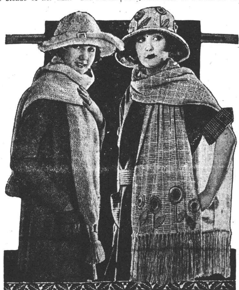
Two of the Latest Hat and Scarf Sets.

At the right of the illustration varn flowers in several colors appear The young lady in the picture is on the hat and scarf and the latter is the blonde of her hair. The ostrich the possibilities of adornment which