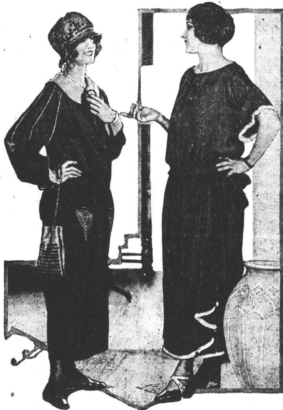
Two Dresses Reflect Moyen-Age.

The dress at the left is of plaid ratine in blue and tan. The collar and cuffs are of white pique and are of course detachable so they may be kept looking fresh. The waist is slightly bloused and is held just over