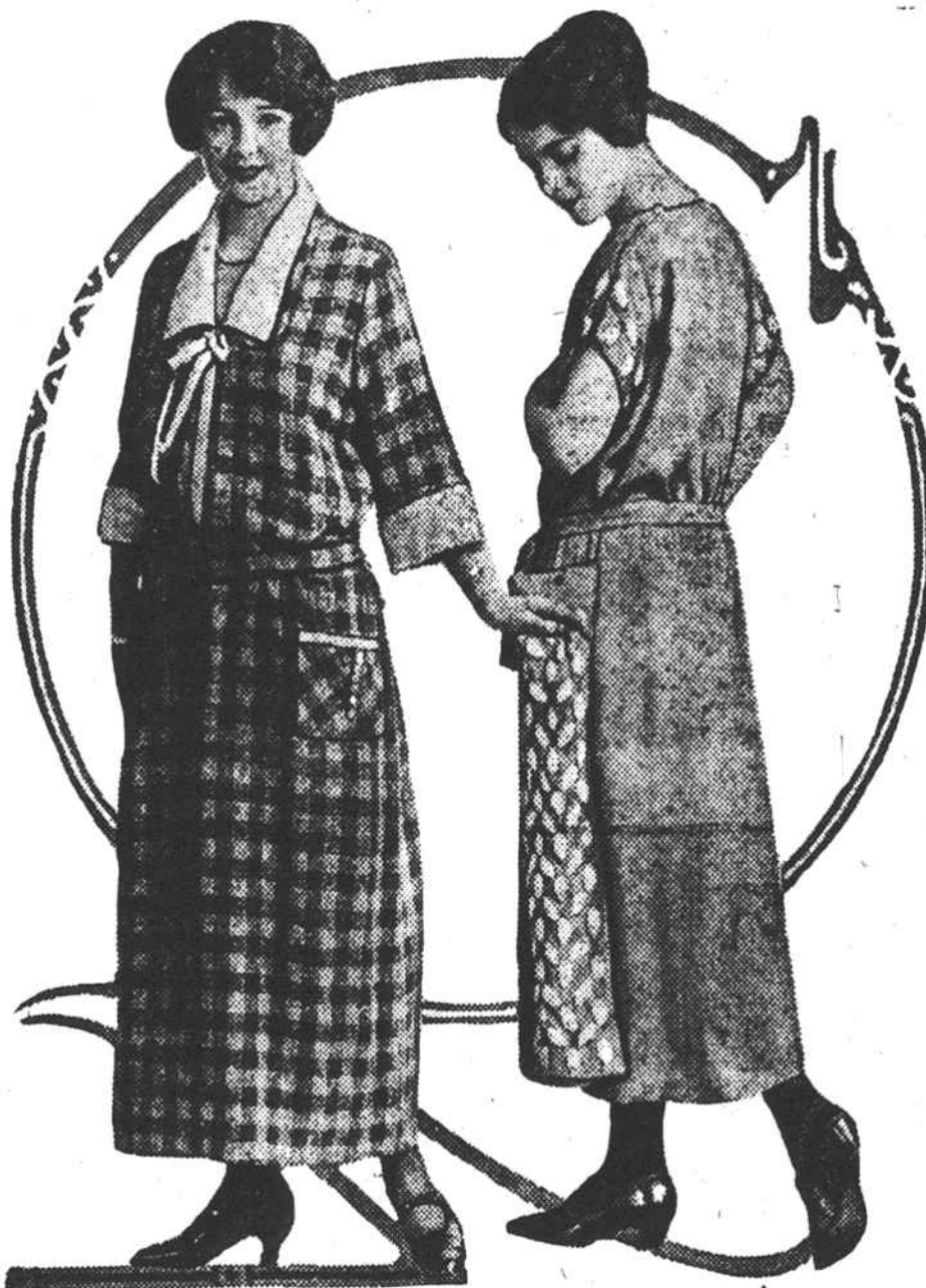
Pretty Wash Dresses.

The dress at the right shows a combination of plain and printed cotton cloths and introduces a new touch in the narrow girdle, of the plain material tied at the front. This model might be accurately described as a morning dress in which the wearer