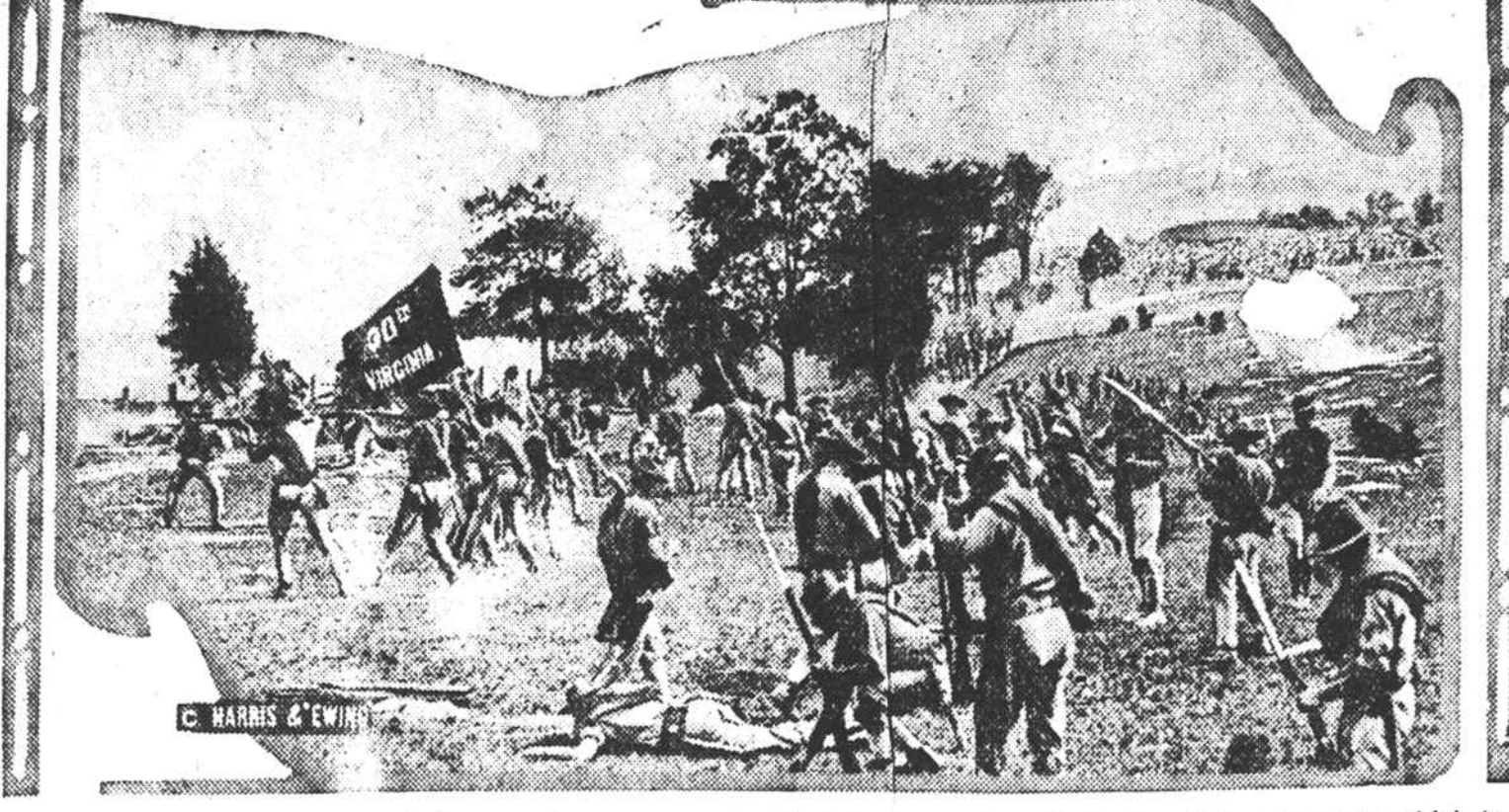
United States marines in their annual maneuvers in Virginia, re-enacting the battle of New Market, which took place in 1864.