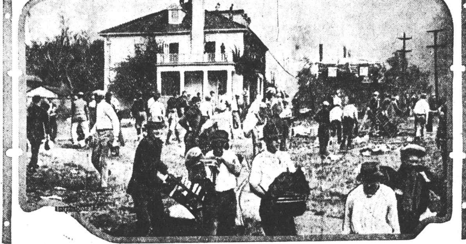
Berkeley, the beautiful city where the University of California is located, was swept by a fire that destroyed some sixty blocks in the best residence section. Students are here seen fighting the flames.