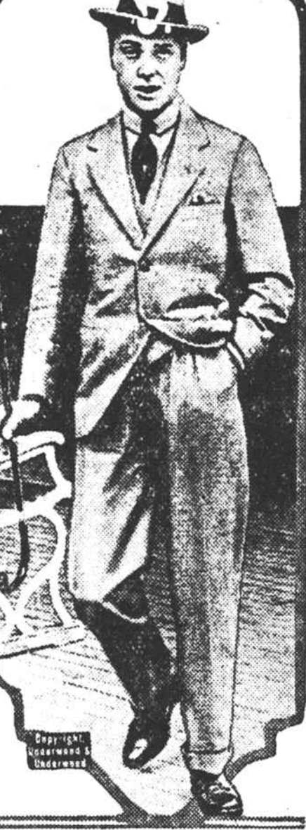
Here is Baron Renfrew, better known as the prince of Wales, as he landed in Quebec on his way to his ranch in western Canada.