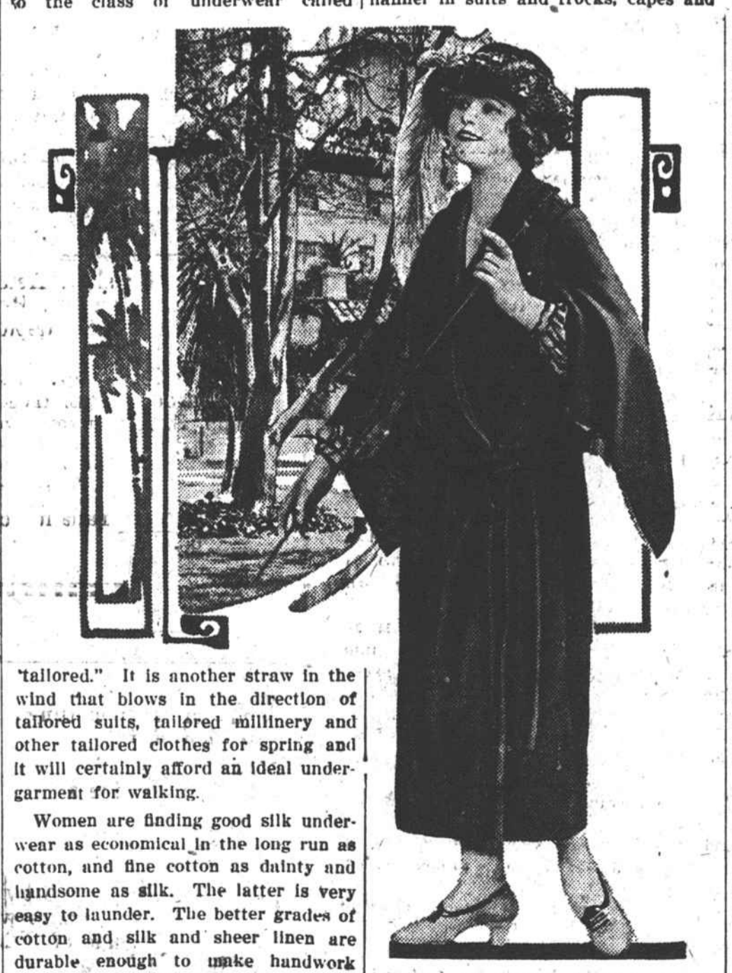
Trim and Snappy Coat-Frock

If the styles approved by visitors to the summerland resorts may be taken as an index of what is coming later in the North, we are to wear flannel in suits and frocks, capes and