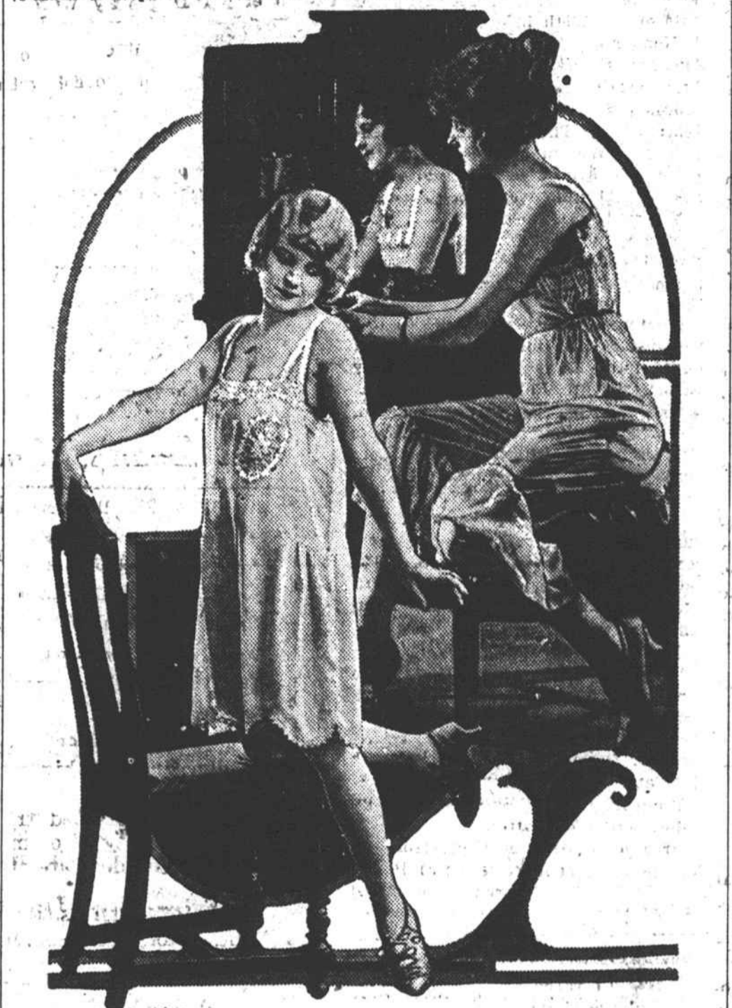
Step-In and Knicker Combination

on the way—with equal chances for finding approval, but only spring can tell which one will prove the favorite—all are in the running. There are some trim and snappy coat-frocks among the first tailored garments to arrive, and they include models with high collars, others with scarf collars and still others with cape effects. One of the last is shown in the picture. This is a very simple affair—which is a strong point in its favor—fastening at the waistline and a little to one side. The long collar is edged with a plaited ribbon and the cape-like sleeves lined with a printed silk that provides also an undersleeve gathered in at the wrist. The narrow girdle is made of the material, which might be any of the smooth-faced