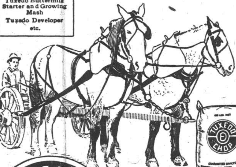
Tuxedo Fed Team of Williams-Pifer Lumber Co., Marlinton, W. Va.