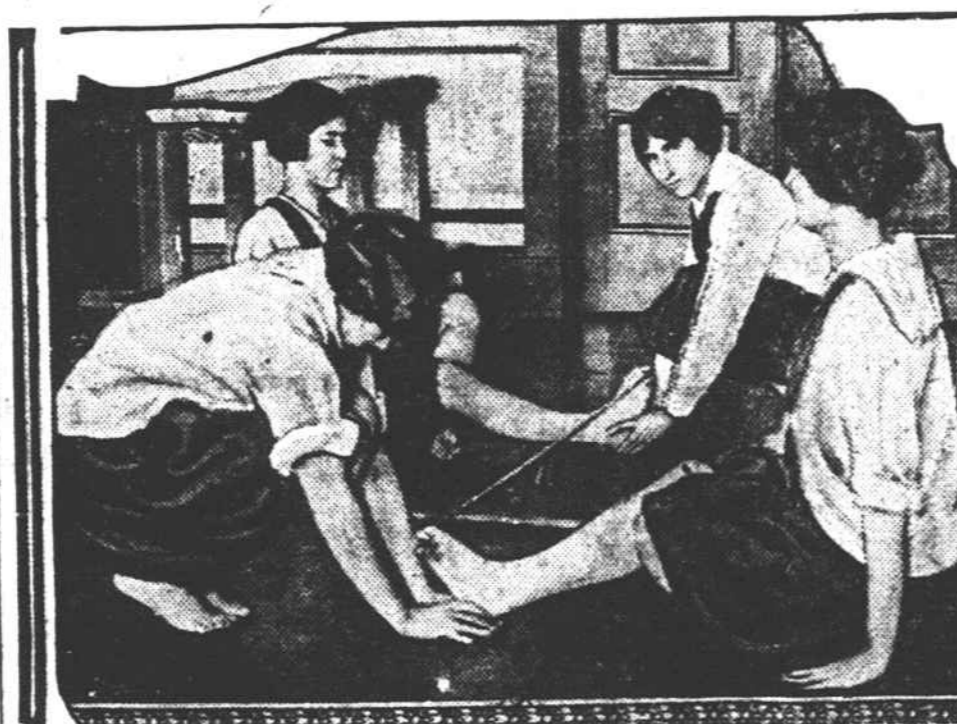
The majority of students of Wellesley college, Wellesley, Mass., do about five miles of walking a day, and this needs good, strong feet. A series of exercises has been introduced to strengthen the foot muscles.