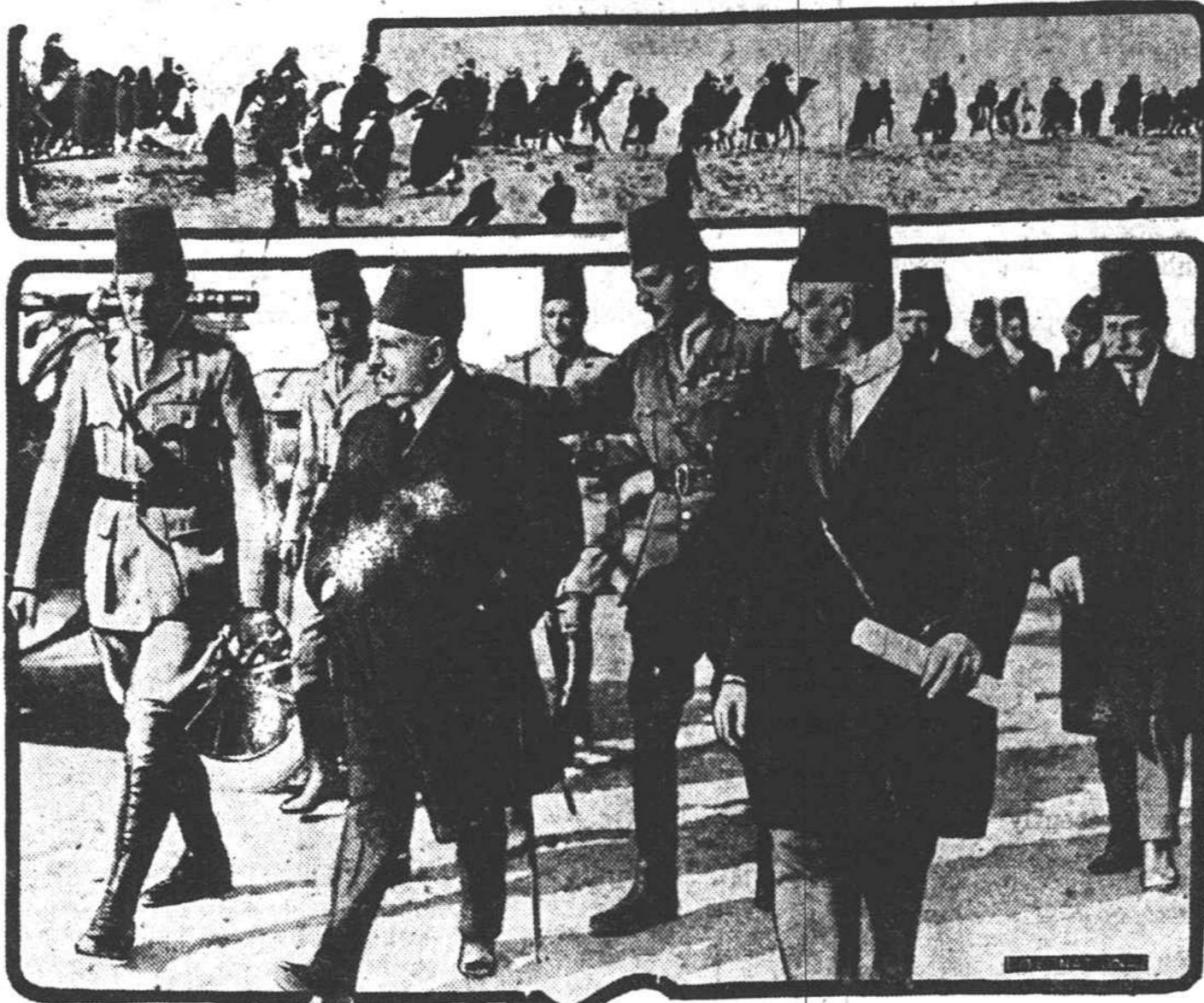
For the first time since the reign of Cleopatra, a ruler of Egypt visited historic Sinai the other day when King Fuad journeyed there. He is shown here (the short, stout man) with members of his suite arriving at El-Arich. Above are shown some of the thousands of natives hurrying, afoot and on camels, to greet the monarch.