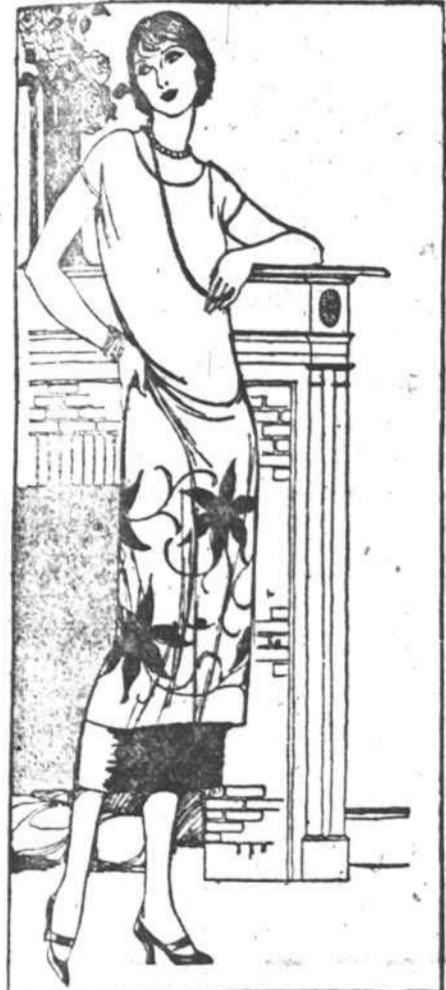
New Tunic Blouse Having Leaf Design Applique in Brown.

Presentments of new design are... The style is tuned to a single... most all of the better... fashion correspondent... On all of the... this is essential, and on... done after the Chi... slashed at the... ornament adds a chic... of the new wraps, the... for afternoon or eve... clasp, or cabochon is... as a fastening. One... ornament is a round flat... formed of a little mirror... with a delicate fretwork of... rhinestones. A clasp... to be added to the coat is... in color, of thin olive... in a pattern of dull gilt. Many other motifs are being made... different materials, from... leather and Egyptian... the most dazzling things set... with stones. Some of these are... the most fantastic patterns, and form an important detail in an... gown. The best and most popular combination in ornaments is of onyx and... There is an elegance in it... appeals to women whose taste is for exclusive styles, and it is one which is not successfully imitated. A gown of black velvet or satin, which has somewhere in its architecture a bit of onyx traced over with diamonds or rhinestones, is never commonplace. Other delightful things like these are being shown in brooches, pendants and earrings—which are longer than ever before. One pair seen in the studio of