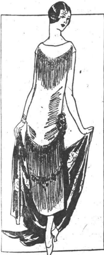
White Silk, Featuring a Combination of Flat and Fringe Embroidery.

an exclusive jeweler is made in the form of two long tassels, the diamond tips of which touch the shoulder—elegant and altogether chic. These jewels or onyx and pearl are but one of the unique fancies of the season. But they are of sufficient importance to form a chapter all their own. Callot featured this sewn-in fringe in the early spring, and it is one of the decorative themes that has become