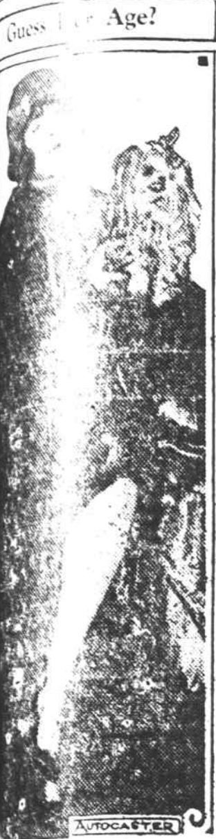
Whether she appears through the country—her seemingly... This is a new photo of... and still a... stage favorite.