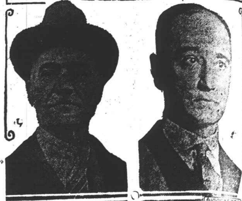
When bloodless battles are raging in the House of Representatives, these two fiery southerners from Tennessee, Finis J. Garrett (left) and John Q. Tilson are always to be found where the argument is hottest. Leaders of their respective Democratic and Republican party factions, they are continually at sword's points.