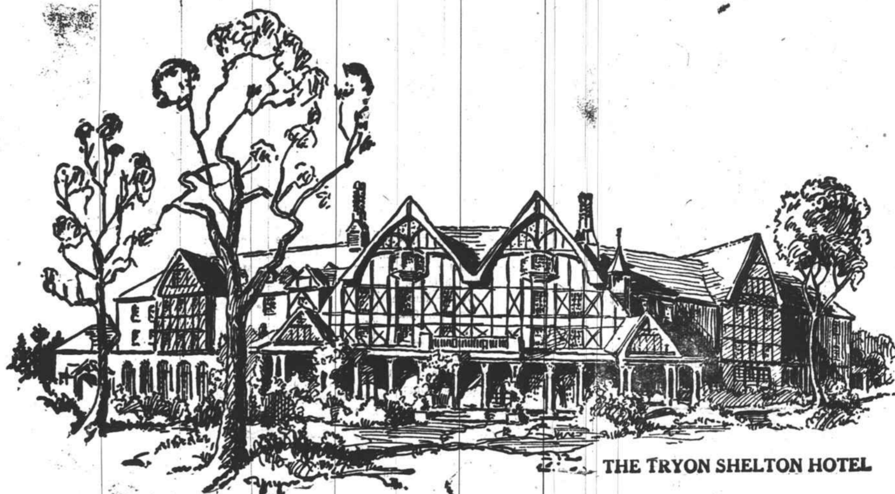
THE TRYON SHELTON HOTEL