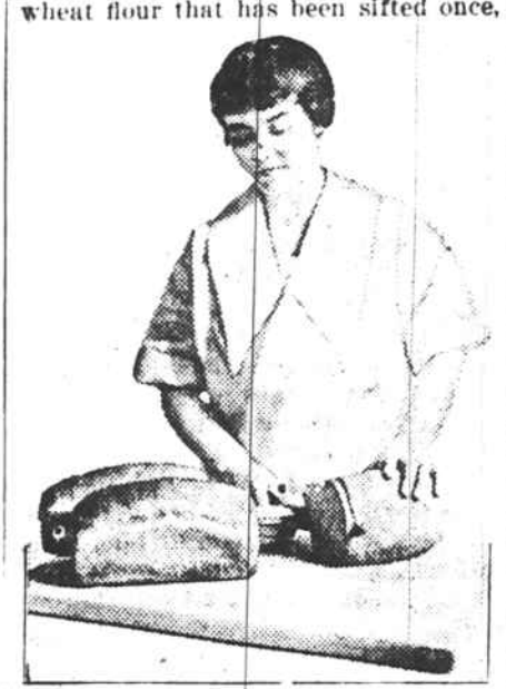
Bread Made of Soft-Wheat Flour.

a powder and the mold breaks up more readily than that of a soft-wheat IN FLOUR TYPES four. Weighing is still another method used to distinguish hard-wheat flours from soft. A quart of hard-