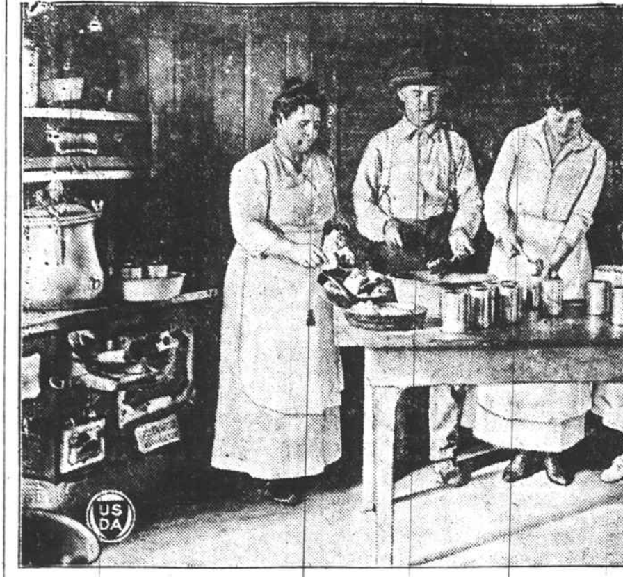
Meats Must Be Canned in the Steam Pressure Canner.

(Prepared by the United States Department as possible. Remove all bones and fill of Agriculture.) The canning of meats on the farm has become one of the most important methods of food preservation. Only meats that have been freshly killed and cleanly handled should be preserved in this way. The United States Department of Agriculture recommends that the steam pressure canner should always be used. A high temperature of 250, degrees Fahrenheit, equivalent to a steam pressure of 15 pounds per square inch, is required to sterilize meats properly and prevent spollage.