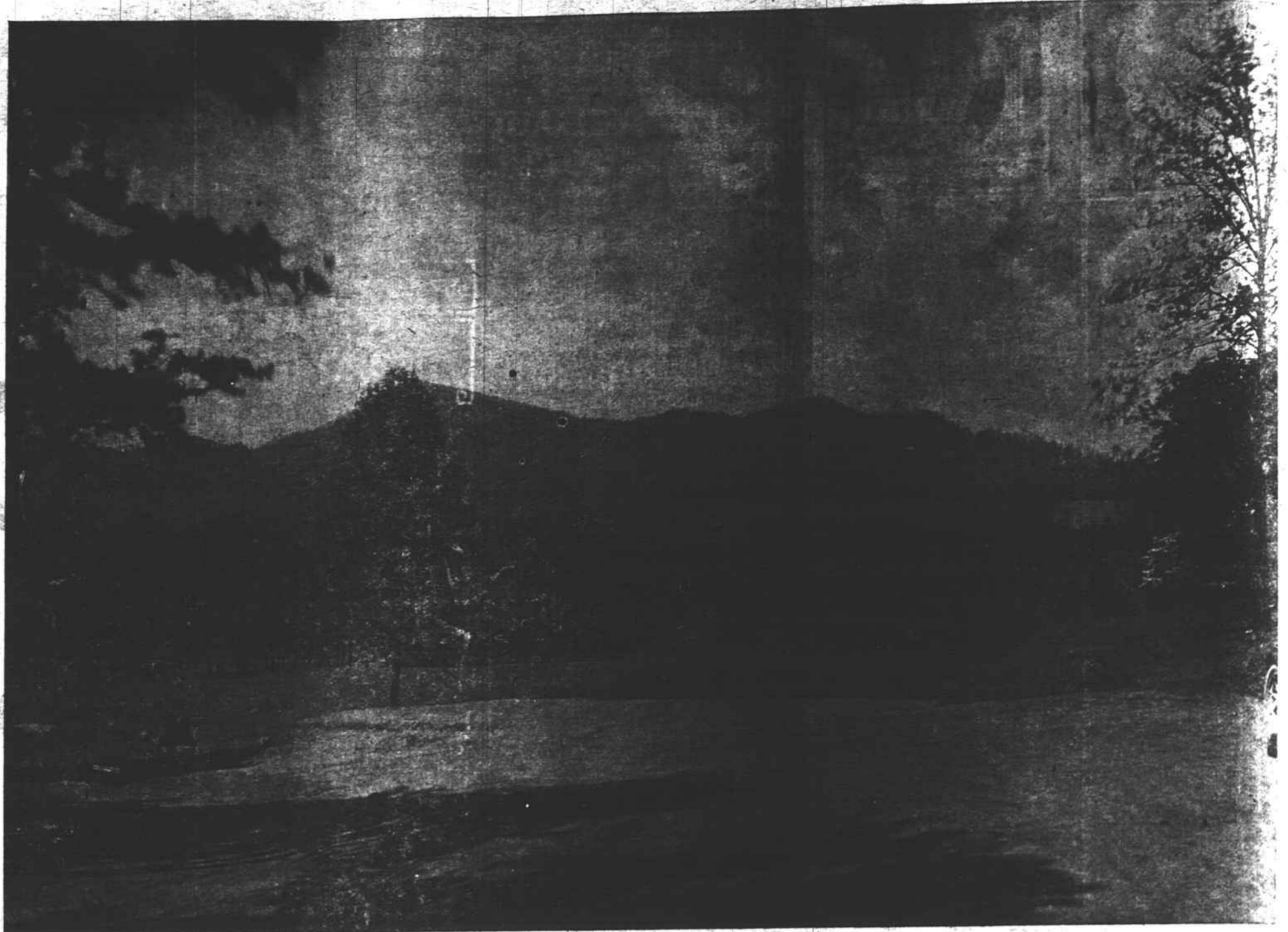
Beautiful Golf Links of Tryon Country Club Where The Favorite Pastime Can Be Indulged All Year Round

It may be necessary to change some social customs to do this, but social customs can be changed. It may be necessary to perfect our laws. It may be necessary to secure better enforcement officials. It will be necessary to change public attitude on the whole question, but it must be done, and what must be done can be done.