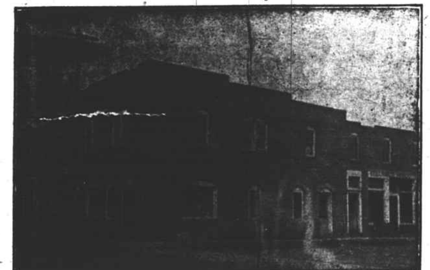
Polk County Bank & Trust Co., Columbus N. C.