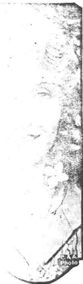
Wick has been beautiful girl in German distinction of "Gretchen" type. Great hit as cinema films.