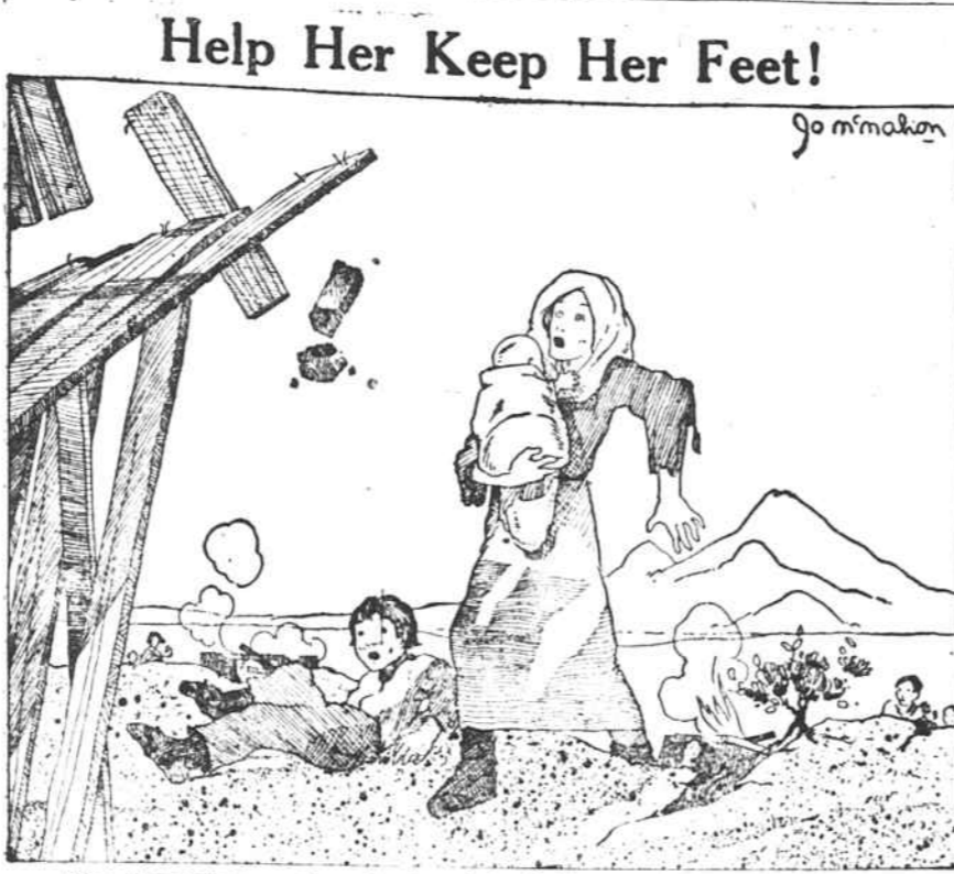
The Armenian earthquake has left 80,000 people homeless. Near East Relief needs $1,000,000 to meet this emergency.