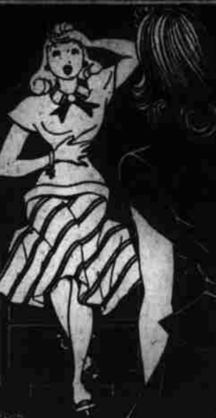
DON'T BE A CALAMITY HOWLER... A chronic complainer about aches and pains is seldom popular with her friends.