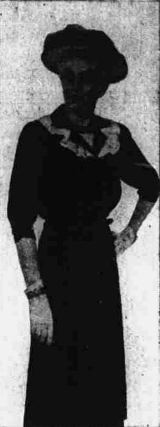
Basic dress of sheer navy crepe styled for a woman's figure. Collar is edged with lace-trimmed organdy.

The recent remark of a well-dressed woman that even though she had never been clothesmad, she had always found it worthwhile to look her best expresses the fashion philosophy of most mature women. This Spring, more so than in seasons, it is entirely possible regardless of what you can spend, or what your size problem happens to be. Styles which "fit to begin with," whether you take regular women's sizes, "extra" sizes, or "half size," for the short and stout, are big news in New York designer collections... and all at a price.