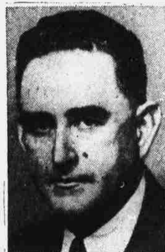
Kerr Scott in Radio Address, June 9th.

"I Cannot and Will Not Travel Backward—I Appeal to You to Join Me in the Solemn Resolution to Keep the Government of North Carolina Marching Forward, and to Keep the Governor's Office as the Office of the People's Servant"—