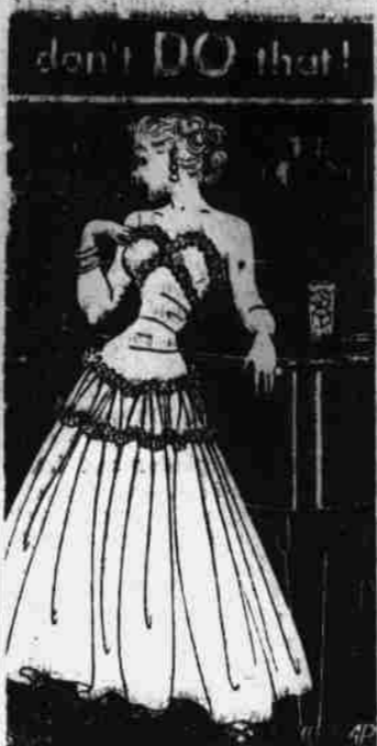
USE A COASTER... Your hostess won't appreciate finding rings from wet glasses on her piano or her best coffee table.

As shown in the picture above, a child's breakfast can be streamlined in serving so that it presents the food in a fashion easy to eat. Many fruit and cereal combinations that speed up the eating of these courses will suggest themselves. The bread course can be chosen for compact eating—a roll buttered—battered toast or easily-masticable pieces, etc. If juice is the fruit course, it can be drunk right along with the cereal course, instead of served separately.