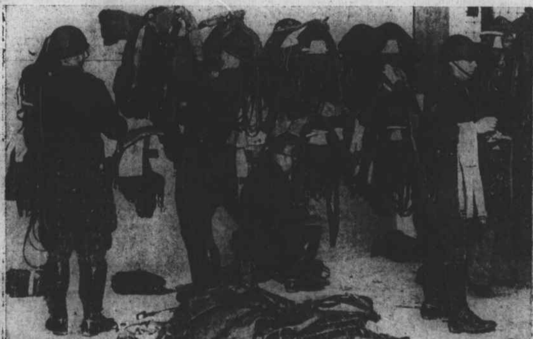
FINISHING TOUCH. Troopers put last minute polishes on their saddles and bridles before hanging them up.