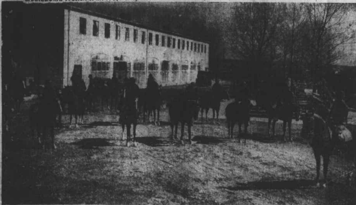
CLIMB DOWN, SOLDIER. Platoon dismounts after drill. In background is an old German garage which now is a U.S. stable.