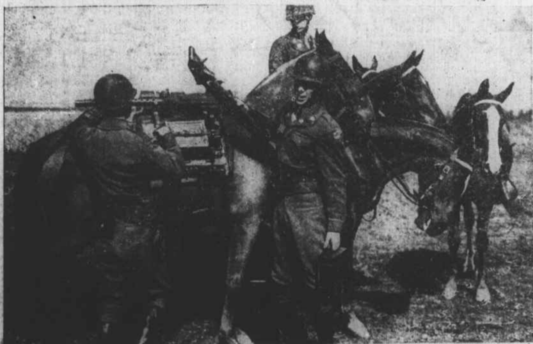
SHAKEDOWN. A detail of the 7766th troop breaks out its machine gun during a drill problem at Schweinfurt.

The U.S. Army's bow-legged brigade is making its last stand in Germany. On the outskirts of Schweinfurt, the 7766th Horse Troop, composed of 162 enlisted men and five officers, still is doing its soldiering with live steeds. There are other horse units here and there, but this is the only troop. The 7766th was organized last August when most of the horse platoons abroad were gathered up and joined into one. Two of the 7766th's four platoons are always on border patrol near the U.S. occupation zone frontier areas. The troop uses all German wehrmacht horses. Here is the 7766th Horse Troop on duty.