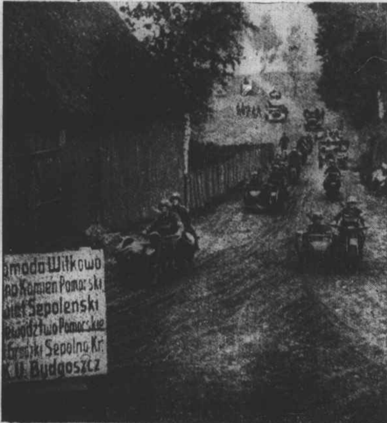
FIRST ACT. Motorized Nazis slice into Poland against weak resistance.

Ten years ago it started — the most devastating, costly, earth-shaking war in human history. At dawn on September 1, 1939, Germany's high-riding Fuehrer, Adolf Hitler, sent his crack mechanized troops racing into Poland. Soon Great Britain and France came into the fight, and before long the flames of war crackled over the entire European continent and Asia and Africa as well. Hitler's War has been over four years now, but Europe is still in turmoil because of it. The destruction, revolution and political upheavals it has caused may leave their mark for centuries. Here are highlights of the European struggle which overturned the world.