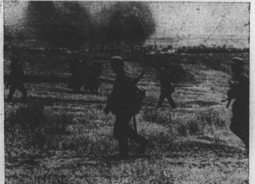
SEIGE OF STALINGRAD. The Nazis failure here marked the war's turning point.