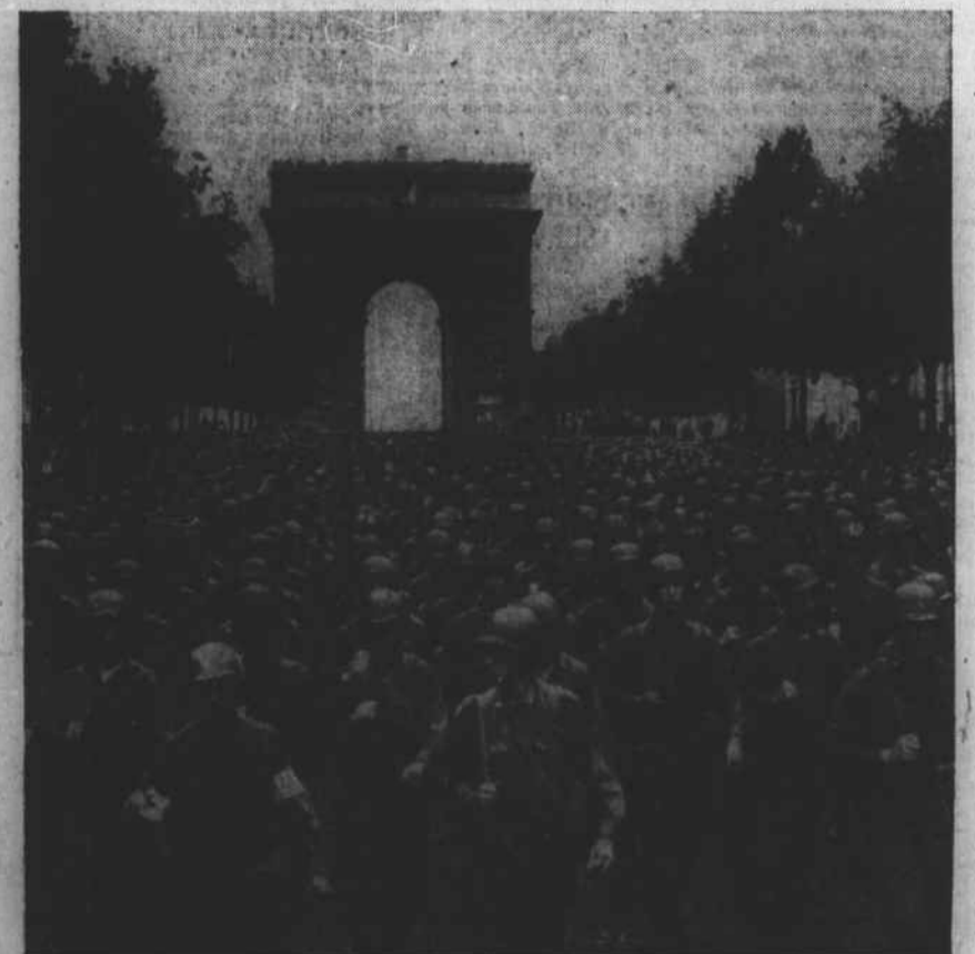
VICTORY'S PREVIEW. As Allies retook Paris, Yanks marched through en route to Berlin.