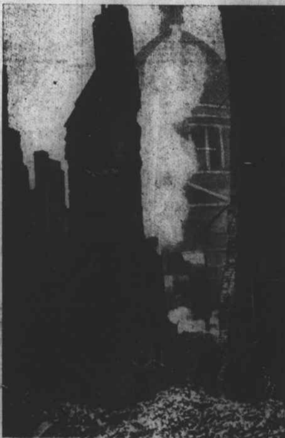
BRITAIN IS BLITZED. Bombs fall at historic St. Paul's.