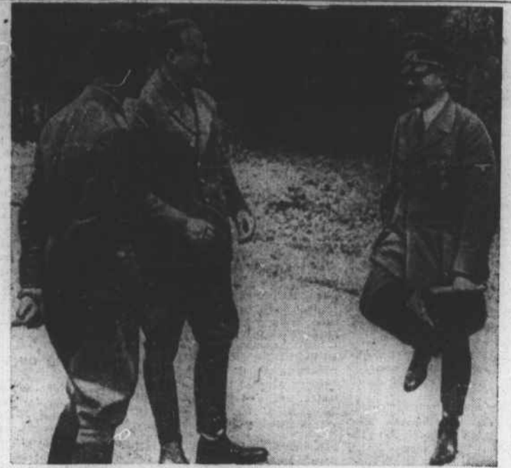
DER FUEHRER'S FUN. Hitler dances a jig as France falls.