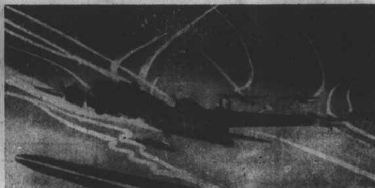
ON THE SKY TRAIL. U.S. bombers fly out to blast enemy territory.