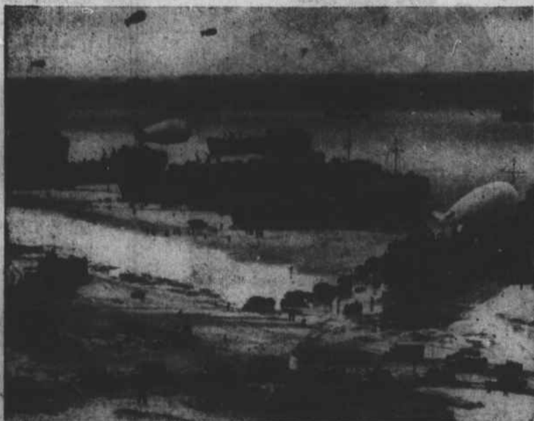
D-DAY. The Allies invaded Normandy with awe-inspiring might.