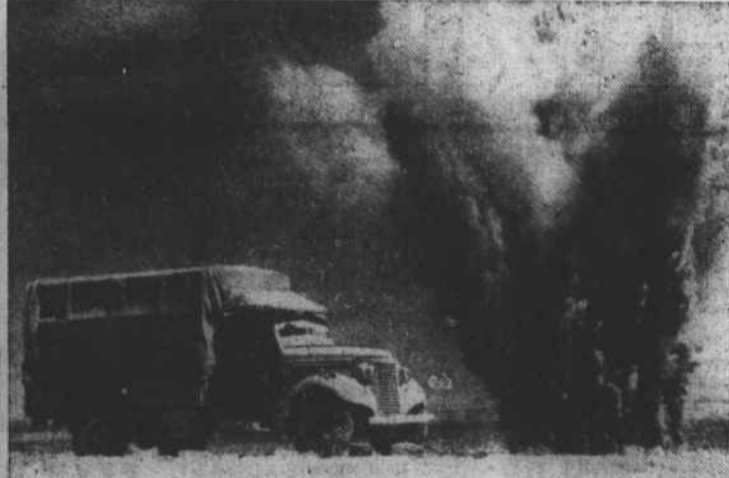
CLOSE CALL. A bomb almost hits an Allied truck on the Egyptian front.