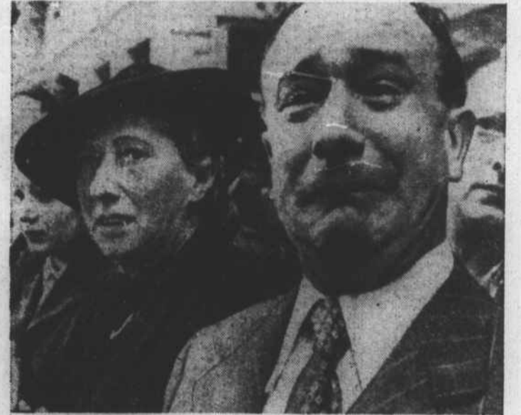
TEARS FOR FRANCE, by a Frenchman, as the Nazis take over.