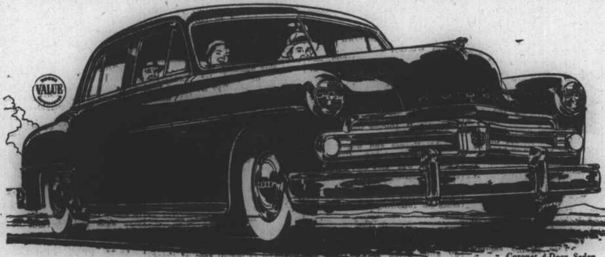
Coronet 4-Door Sedan

Now on Display... See it Today NEW... BIGGER VALUE 1950 DODGE!