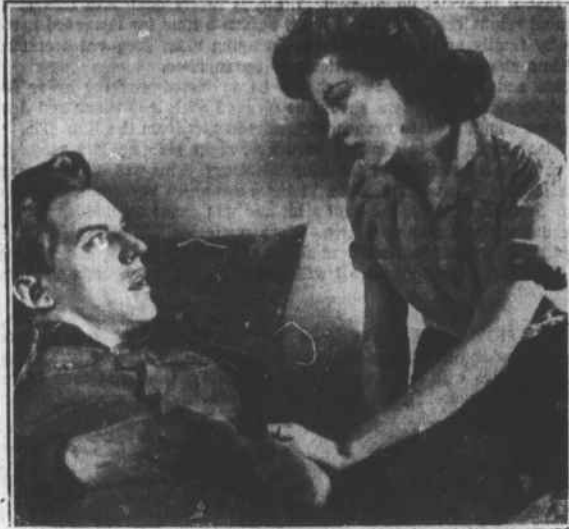
Susan Hayward and Robert Mitchum arrive at a serious decision during a climatic episode in "The Lusty Men," drama of life on the rodeo circuits. Also starred by Wald-Krasna Productions are Arthur Kennedy and Arthur Hunnicutt. RKO distributes.