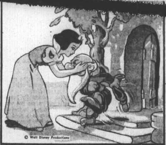
Grumpy thaws. In Walt Disney's re-issued musical all-cartoon "Snow White and the Seven Dwarfs," in color by Technicolor, the Snow White character finally succumbs to the cordiality of Snow White.