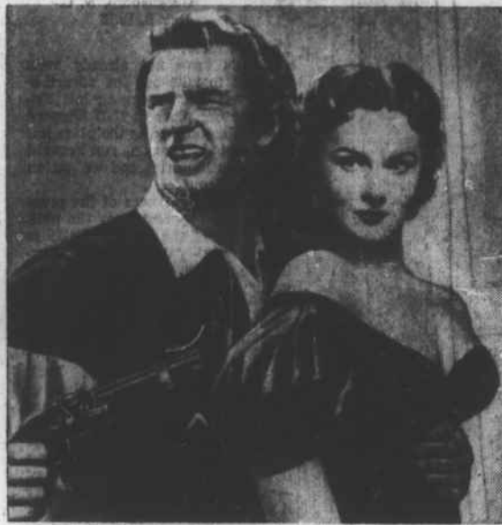
The Golden Hawk and the woman called Rouge are portrayed, in Columbia Pictures' "The Golden Hawk," by Sterling Hayden and Rhonda Fleming, in color by Technicolor. The Spanish Main adventure romance is based on the best-seller by Frank Yerby whom the New York Times has called "the most popular writer in America."