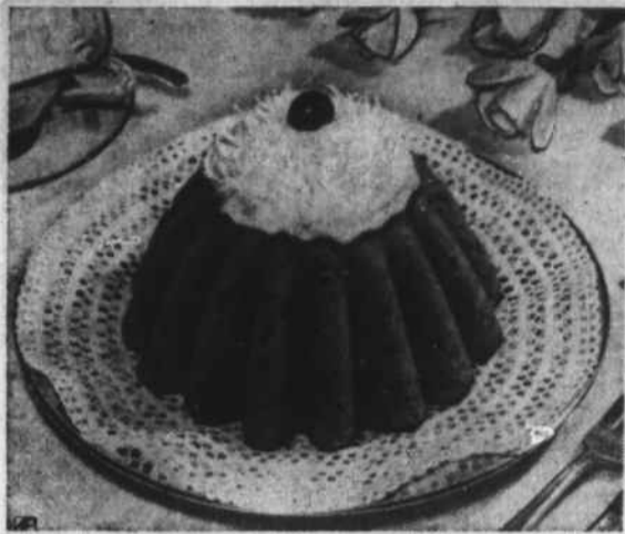
Steamed pudding made with squash or pumpkin is a delightful and satisfying winter dessert.

By CECILY BROWNSTONE Associated Press Food Editor