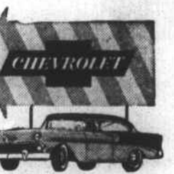
America's largest selling car—2 million more owners than any other make.

Chevrolet's astonishing roadability is a big reason why it's America's short track stock car racing champion. It can and does out-run and out-handle cars with 100 more horsepower. When you wed rock-solid stability to superb engines such as the 225-h.p. V8 that flashed the Corvette to a new American sports car record—then you get a real championship combination. Stop by for a sample!