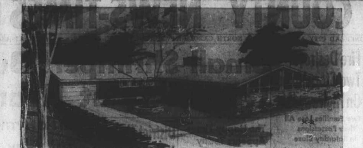
L-shaped in its arrangement, this eight-room ranch house has three main living areas, a quiet area, a formal area and an informal area. Its entrance, at the intersection of the two arms of the "L", is reached through a front garden.