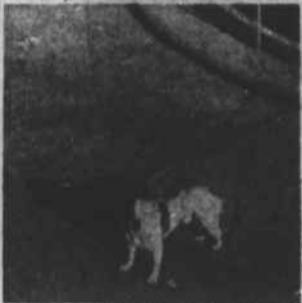
This is Bugs

I like "Bugs". I call him that because he chases flies and hornets. He can knock down my Daddy. I cannot catch "Bugs" when he runs. He is big and funny. He has had three homes. He was given away because they had too many dogs. But I like him very much.