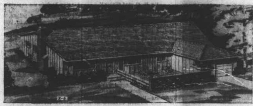
A children's play terrace is a feature of this seven-room house. A kitchen window overlooks the terrace for supervision. An outdoor masonry planter serves to elongate the front.

By JOHN O. B. WALLACE This well proportioned house, designed around a three-room hub of living for more family comfort, makes use of a modular pattern in its layout to cut construction waste to a minimum. Designed exclusively for the House of the Week series and designated X-5, its use of the principles of modular layout simplifies the assembly units which go into a house. This particular plan, developed by Architect Herman H. York, uses a module (unit of measurement) of 2 feet. In showing the room sizes, the modules will vary slightly from the dimensions shown because partitions are in the center of a modular grid.