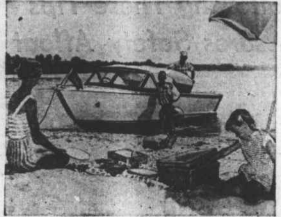
A family picnic is much better when it is from your own boat. Pick a nice secluded sandy beach, run your bow up on the shore and hop out on dry land, ready to eat.