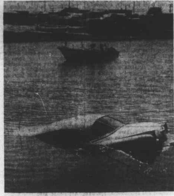
though the car went in rear end first, it swung around when it hit the