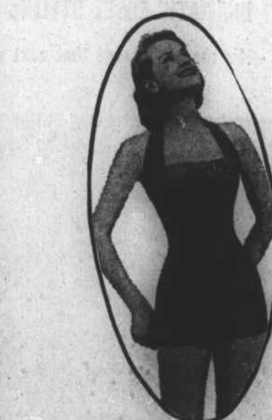
Figure-following draped sheath. Black, coral, blue latex; rhinestones. 32-38. $5.88

savings so special you'll want two! SAVE $3! TOP MAKER LASTEX SWIM SUITS