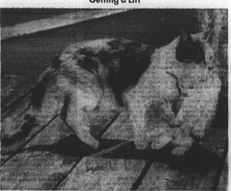
This is the way a mother cat carries her kitten. This kitten was playing on a dock and almost fell in the water. The mother grabbed her baby just in time to keep it from falling in. She carried it to a safe place. She's a good mother, don't you think?