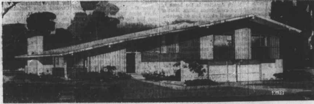
A sloping roof line creates a pleasing exterior for this three-level split with a flexible room arrangement which makes it an ideal choice for a growing family. The upper bedroom wing is over the