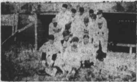
Pictured above is the 1928 edition of the Twin City baseball team. The team played semi-pro ball all over the state on a home-and-home game basis. The players are identified in the story below.