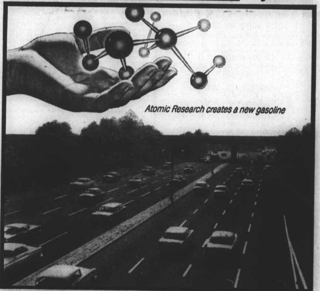
Atomic Research creates a new gasoline