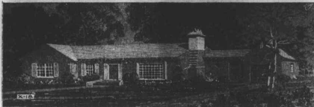
This seven-room ranch style home, inspired by Bermuda architecture, was designed to be built anywhere in the United States, either with or without a basement. The "Bermuda room," an outdoor, partly shielded breezeway, can be fully enclosed if desired.