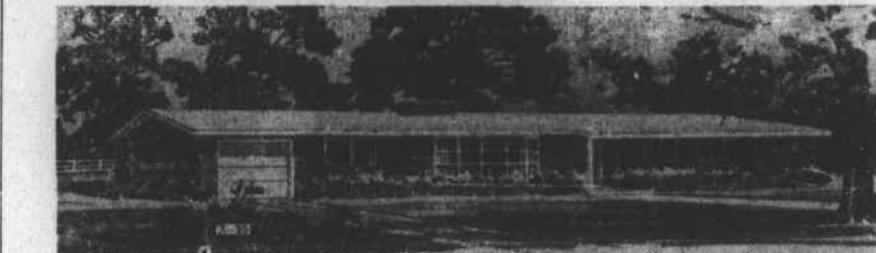
Stone and vertical boards are used for the front exterior. The entrance is recessed. A feature with special appeal to women is the extra-wide bow window in the living room.

'The Family House' It is a family house because the large family room opens to an outdoor living area and the kitchen and family room open into each