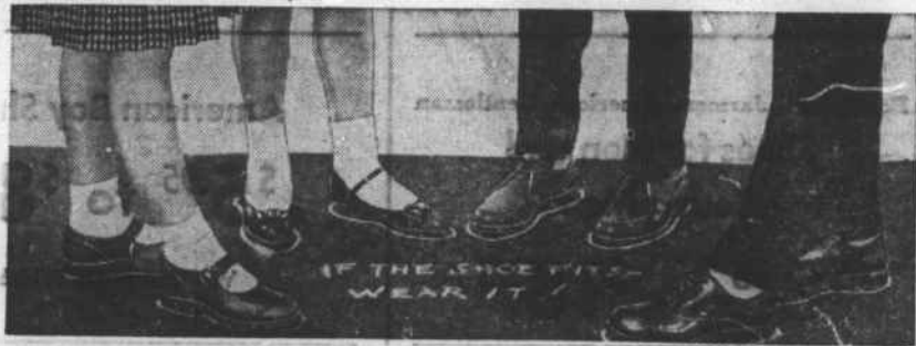
Shoes for back to school this fall offer fashion and comfort for growing feet. Left, smooth leather one-strap sandals, by Fleet-Air, with contrasting sharkskin toe with resistance to scuffing; a patent leather convertible, by Poll-Parrot, has the fashionable tapered square toe and perky little bow as a pump or one-strap. Fashion comes to brother's feet in a brown smooth leather two-eyelet tie on trim — with decorative criss-cross stitch; and borrowed from the college campus, a five-eyelet cordovan-colored oxford, by Fleet-Air, in polished side leather.

Getting down to correct fit, be sure that the salesman measures each foot while it is bearing your youngster's full weight; then fits the larger foot. Since shoe styles vary, and your youngster's feet most likely will have grown during summer vacation, you can't go by his old shoe size.