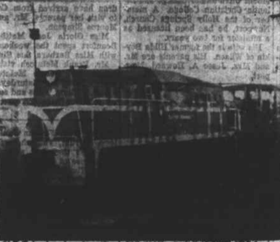
The engine pictured above has been leased from Preston Duffy and Son, Columbus, Ohio, by the Beaufort and Morehead Railroad. The engine arrived in Beaufort last week.