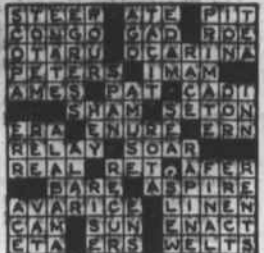
Solution to Tuesday's Puzzle