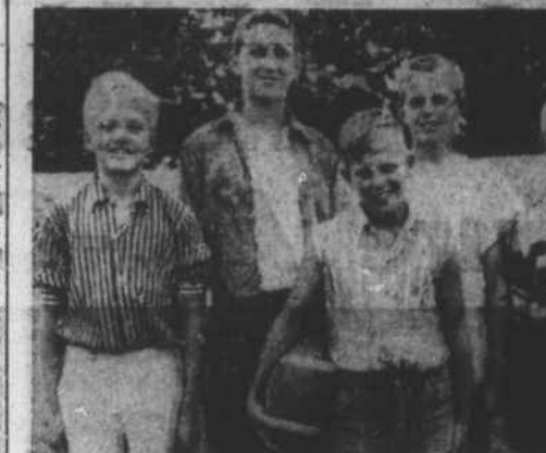
The Beaufort Seadogs will have plenty of attention from "assistant coaches" this year.