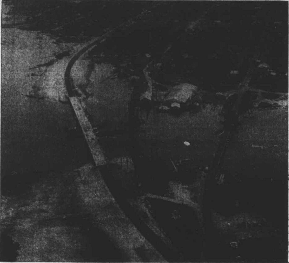
This aerial view shows the new bridge, left, across Gallants Channel (now called Beaufort channel, according to the signs erected at the bridge); the railroad bridge and at the right the old bridge which is being dismantled. In the background is the town of Beaufort. Highway at center, coming from the new span, leads west to Morehead City. The new bridge and approaches are on highway 70.