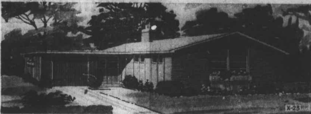
You can build this smart ranch house without crippling the family budget. There are three bedrooms in a wing at the right. The dining-living room and the kitchen are at the back. Optional basement plans are offered — a full basement, partial basement or no basement.