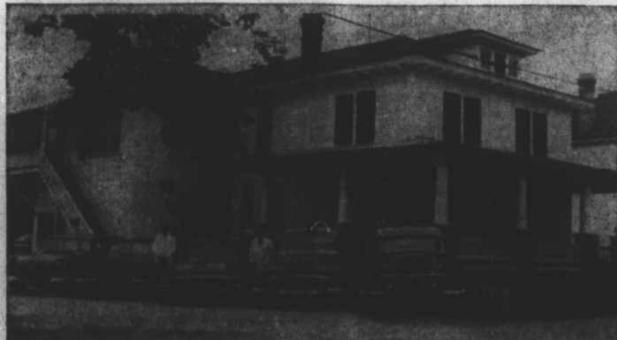
Adair Funeral Home, pictured above, has all equipment necessary to conduct a quiet, dignified funeral. Here are the funeral flower cars, ambulances and the hearse.

Open House Every Day, the Week of September 29th