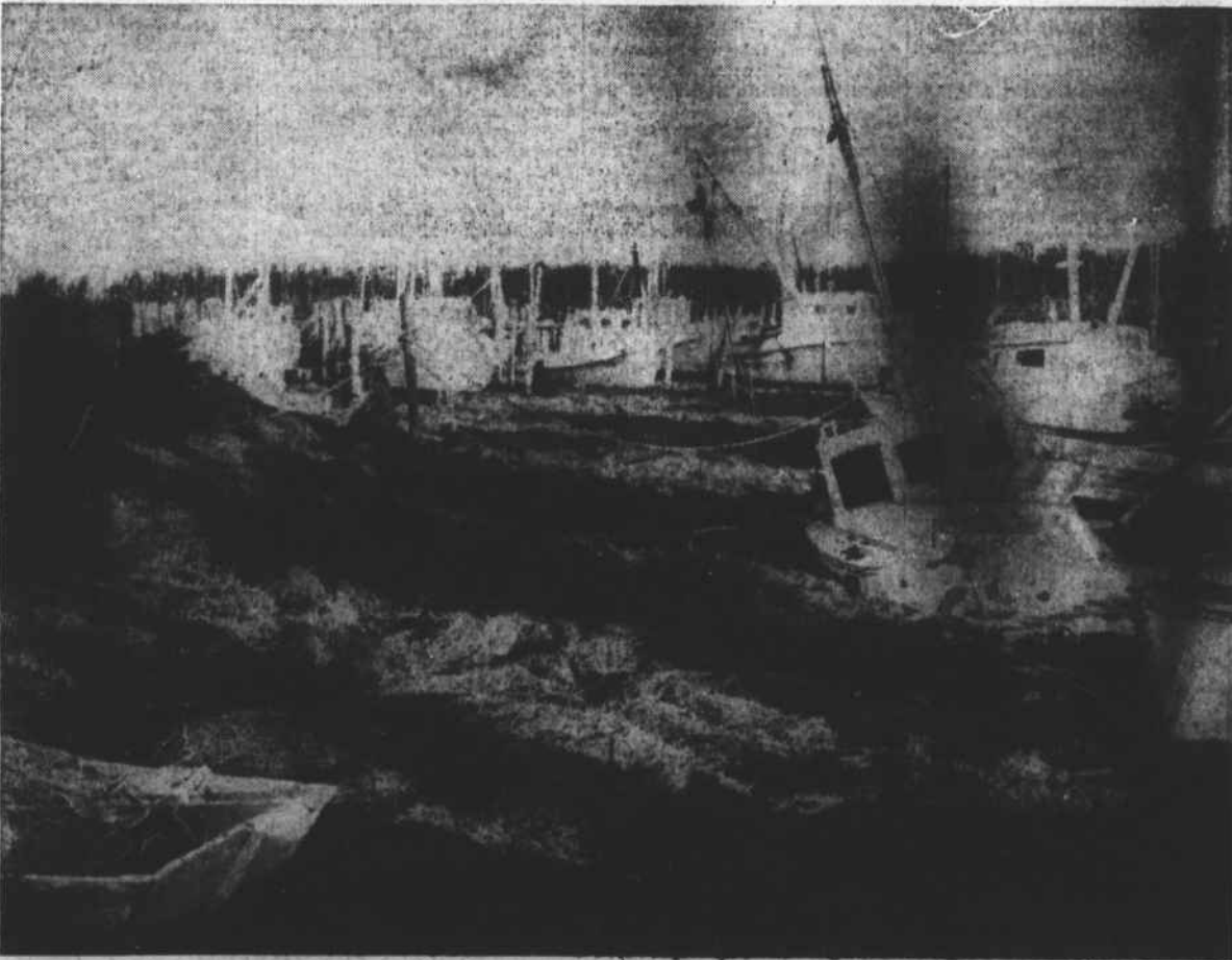
Boats moored along the thoroughfare between Cedar Island and Atlantic fared pretty well during Helene. These boats, seemingly on dry land, are in deep water. Dead marsh grass was floated across the road and is one to three feet thick on top of the water. The road was blocked for a time by the marsh grass, at some places 4 feet deep on the hard surface.