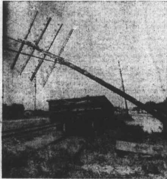
This telephone pole is one of a string of six poles blown over or broken off along the railroad track near Camp Glenn. The fallen lines had to be repaired before trains could get through.