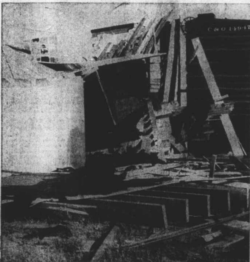
Thousands of dollars of damage was caused to the Freeman Wholesale Co. when the roof blew off between 3 and 3:30 p.m. Saturday. Rain then caused more loss by wetting the merchandise stored inside. Part of the concrete block wall collapsed on the west side, shown above, and landed on top of a box car.

More HURRICANE HELENE Pictures On Other Pages This Issue