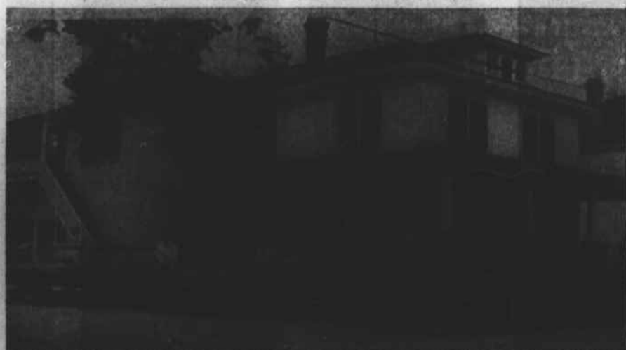
Adair Funeral Home, pictured above, has all equipment necessary to conduct a quiet, dignified funeral. Here are the funeral flower cars, ambulances and the hearse.