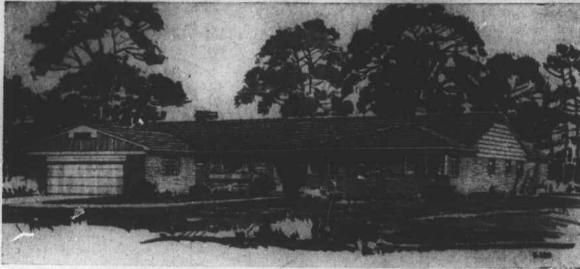
Brick and stone veneer gives this house solidity combined with economical upkeep.